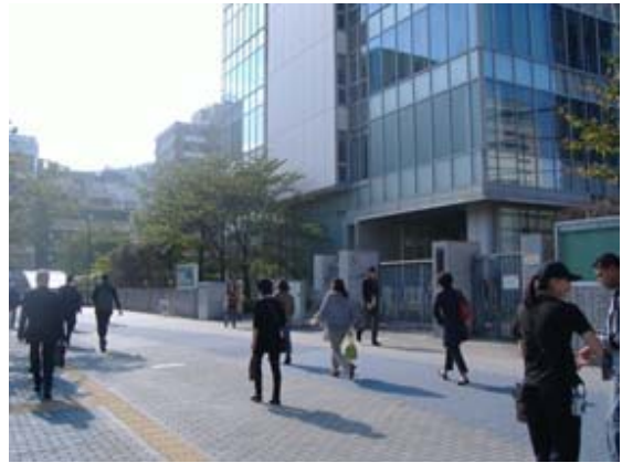
Road in front of Campus Innovation Center