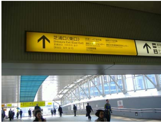
East Exit of JR Tamachi Station