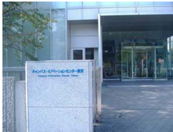
Entrance of Campus Innovation Center