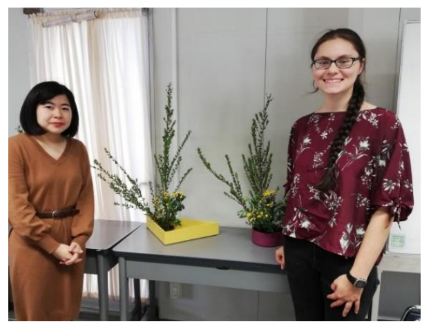
Ikebana Event held by Meguro International Friendship Association (MIFA)

This program established a two-year probationary period from 2019 to 2020, and is scheduled as a formal and sustainable exchange program for a long time to come.